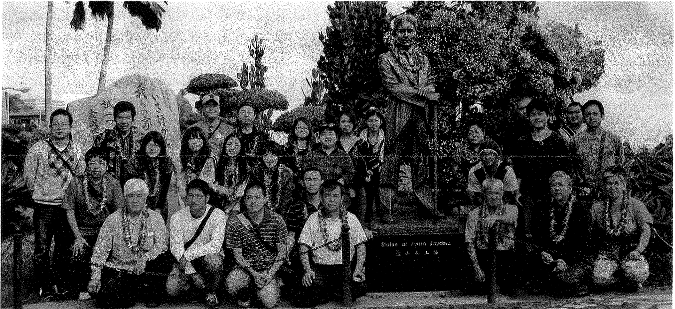
Kin Cho Kinku Dento Geino Hozonkai (Kin Town, Okinawa)