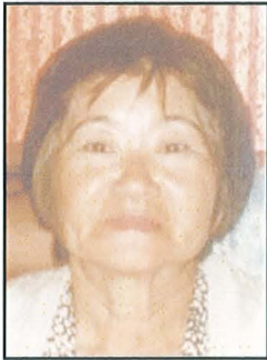
KIN CHOJIN KAI