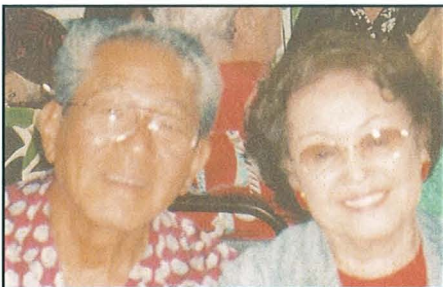
KUBA ROSEI KAI