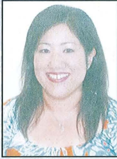
ITOMAN SHIJIN KAI